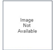
Kevin Hanford At-Large

Term Expires: December 2011 Term Expires: December 2011 Term Expires: December 2015 Term Expires: December 2013