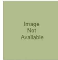
Jason Gamble Position 6